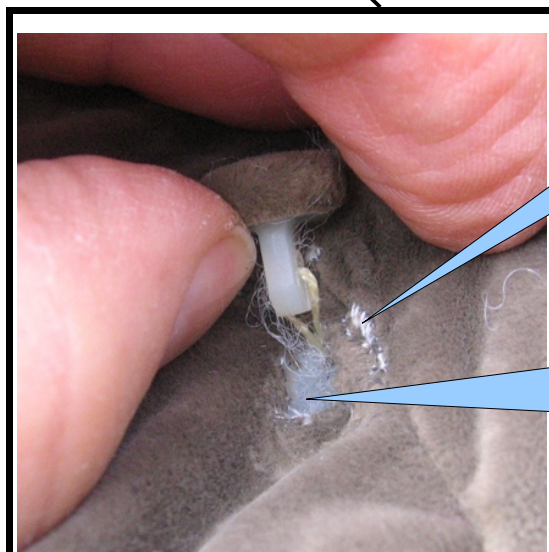
Illustration 2: Close Up of tears

Illustration 2 shows a close up of button on center cushion.